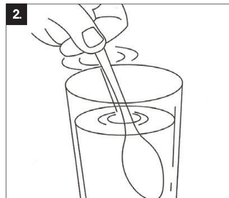
Figure 2. Mix dose in beverage or infant formula.

It is recommended that approximately half of your dosage be taken at the beginning of each meal or snack and the remainder of your dosage be taken during the meal or snack.